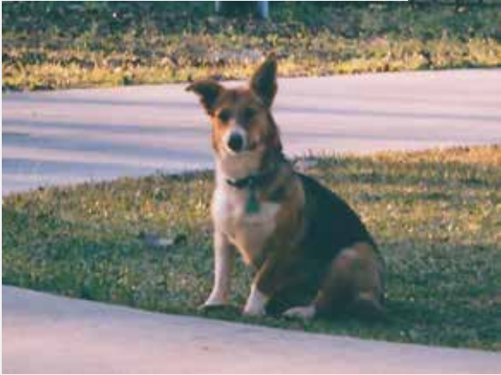
Cookie in her younger years.