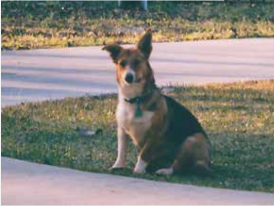
Cookie in her younger years.