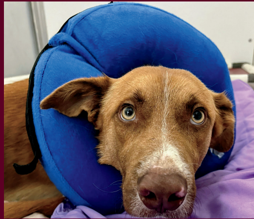
Surgery was a success!