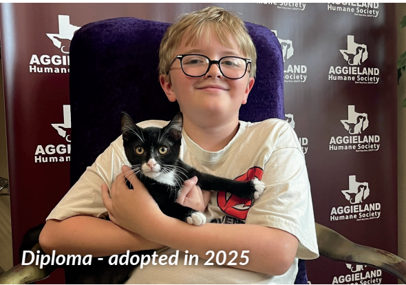
Diploma - adopted in 2025