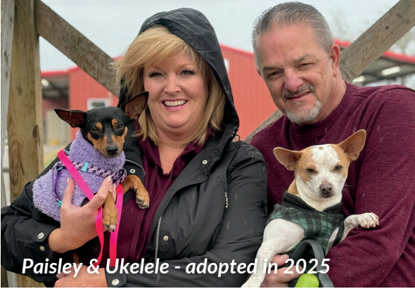
Paisley & Ukelele - adopted in 2025