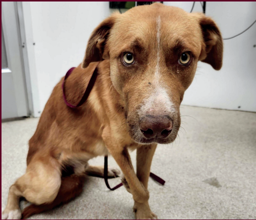
Scared, but finally safe

Neptune's impact lives on in every pet helped, and Oates' recovery is a direct result of that ongoing legacy. By giving to the pets, you ensure that Neptune's story continues, bringing hope and healing to pets like Oates every day.