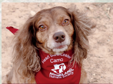
Camo Head Bark Leader