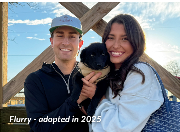
Flurry - adopted in 2025