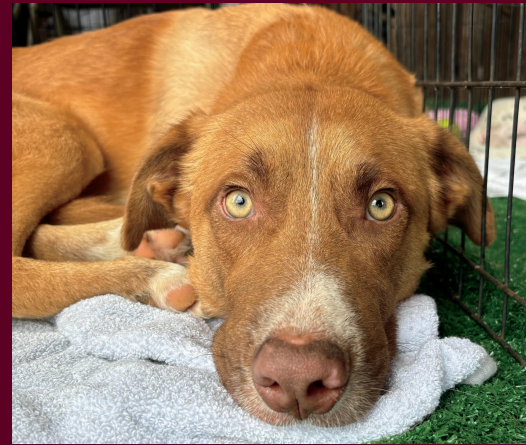
Waiting for his family ❤️

Frozen with fear and visibly injured, Oates desperately needed help. Thankfully, Oates had you by his side - and Neptune's legacy guiding him.