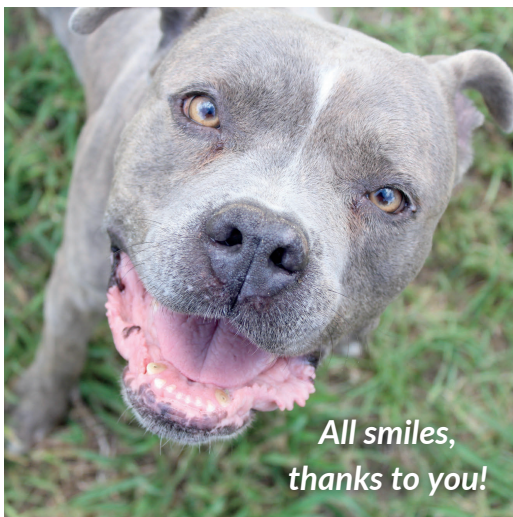
All smiles, thanks to you!