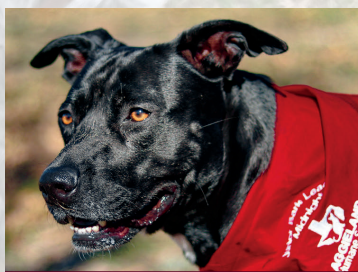
Midnight Junior Bark Leader