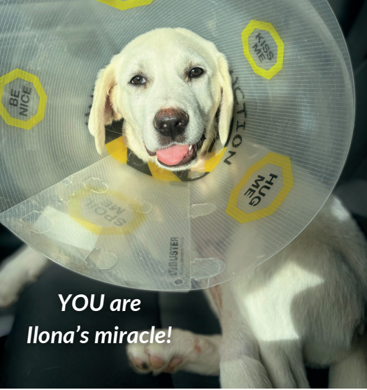
YOU are Ilona's miracle!