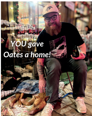
YOU gave Oates a home!